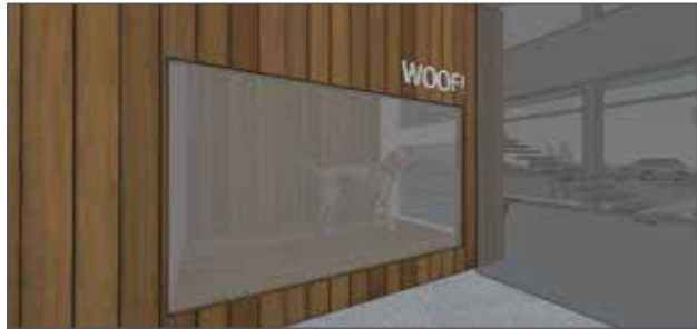
FEATURED PET DORM