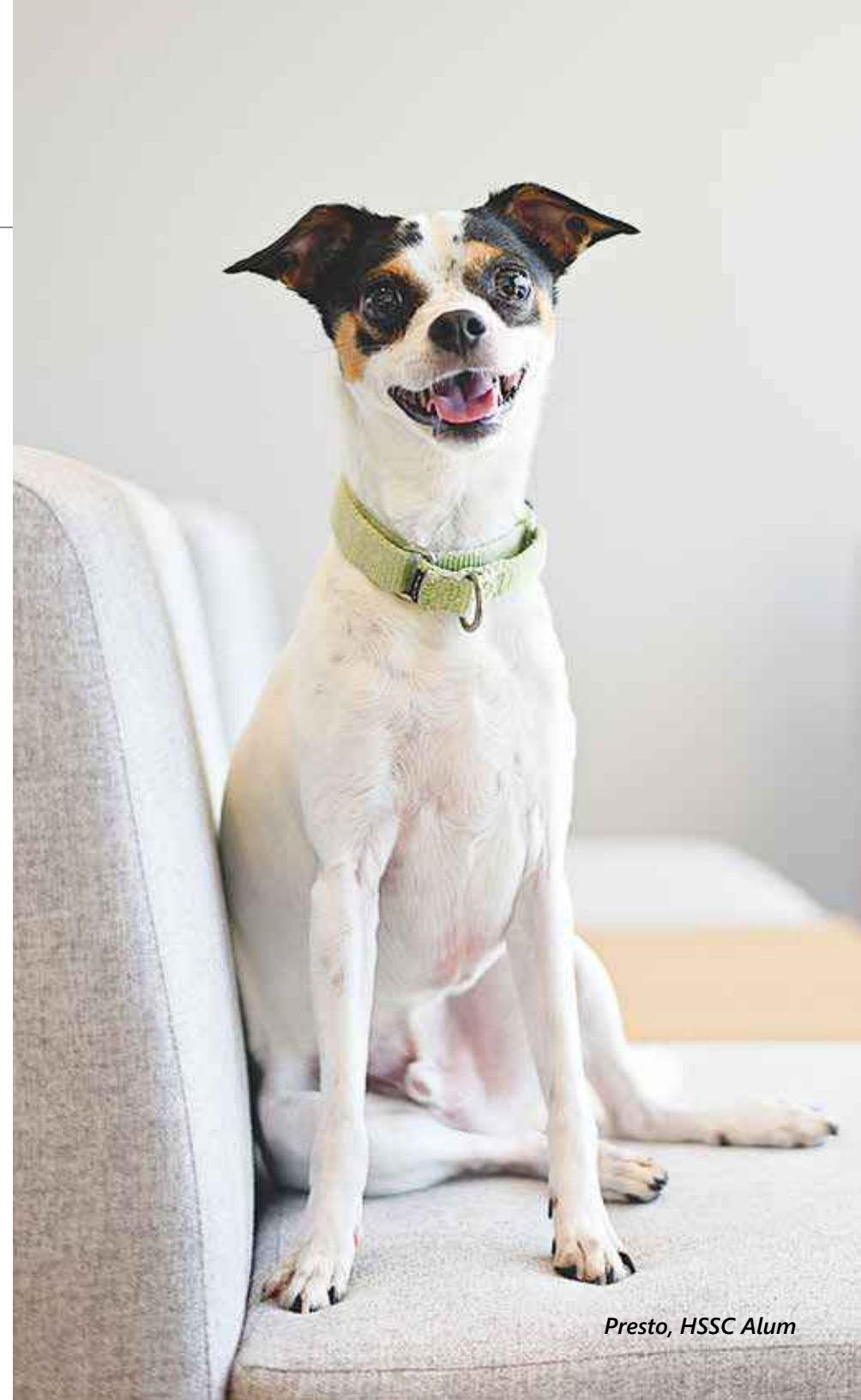
Presto, HSSC Alum