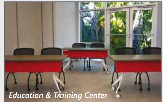
Education & Training Center