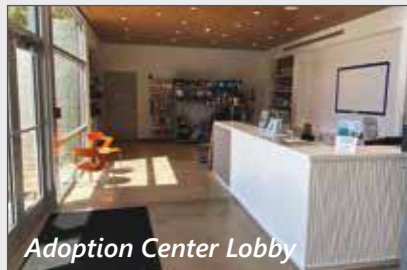
Adoption Center Lobby