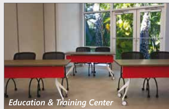
Education & Training Center