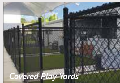
Covered Play Yards