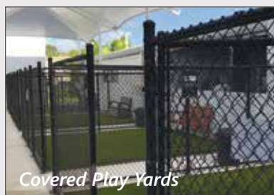
Covered Play Yards