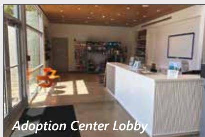
Adoption Center Lobby