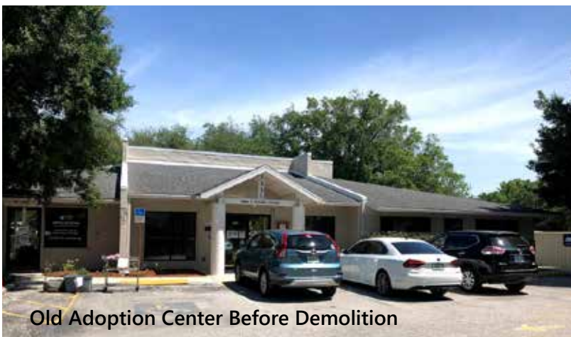
Old Adoption Center Before Demolition

Note: HSSC is not planning to close during construction (except for mandatory COVID-19 closures). We will still be taking in animals, doing adoptions, and holding our many programs and services on campus. Please visit us during normal adoption hours, Tuesday–Friday 10am–6pm and Saturday 10am–4pm.