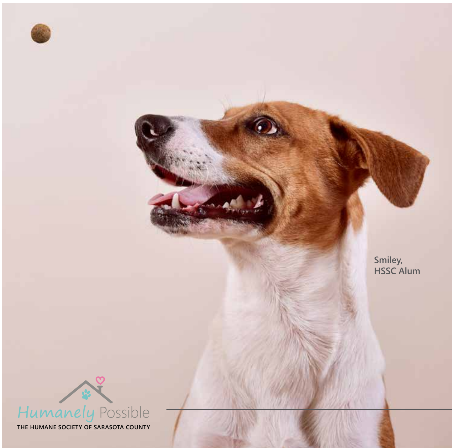
Smiley, HSSC Alum