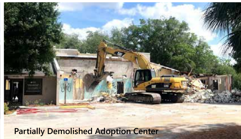
Partially Demolished Adoption Center