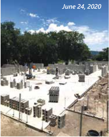
June 24, 2020