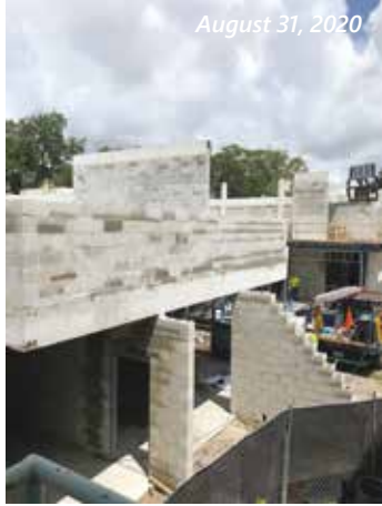
August 31, 2020