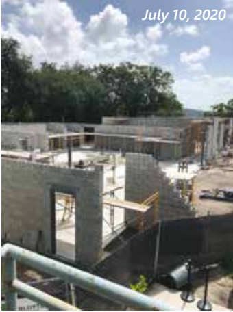
July 10, 2020