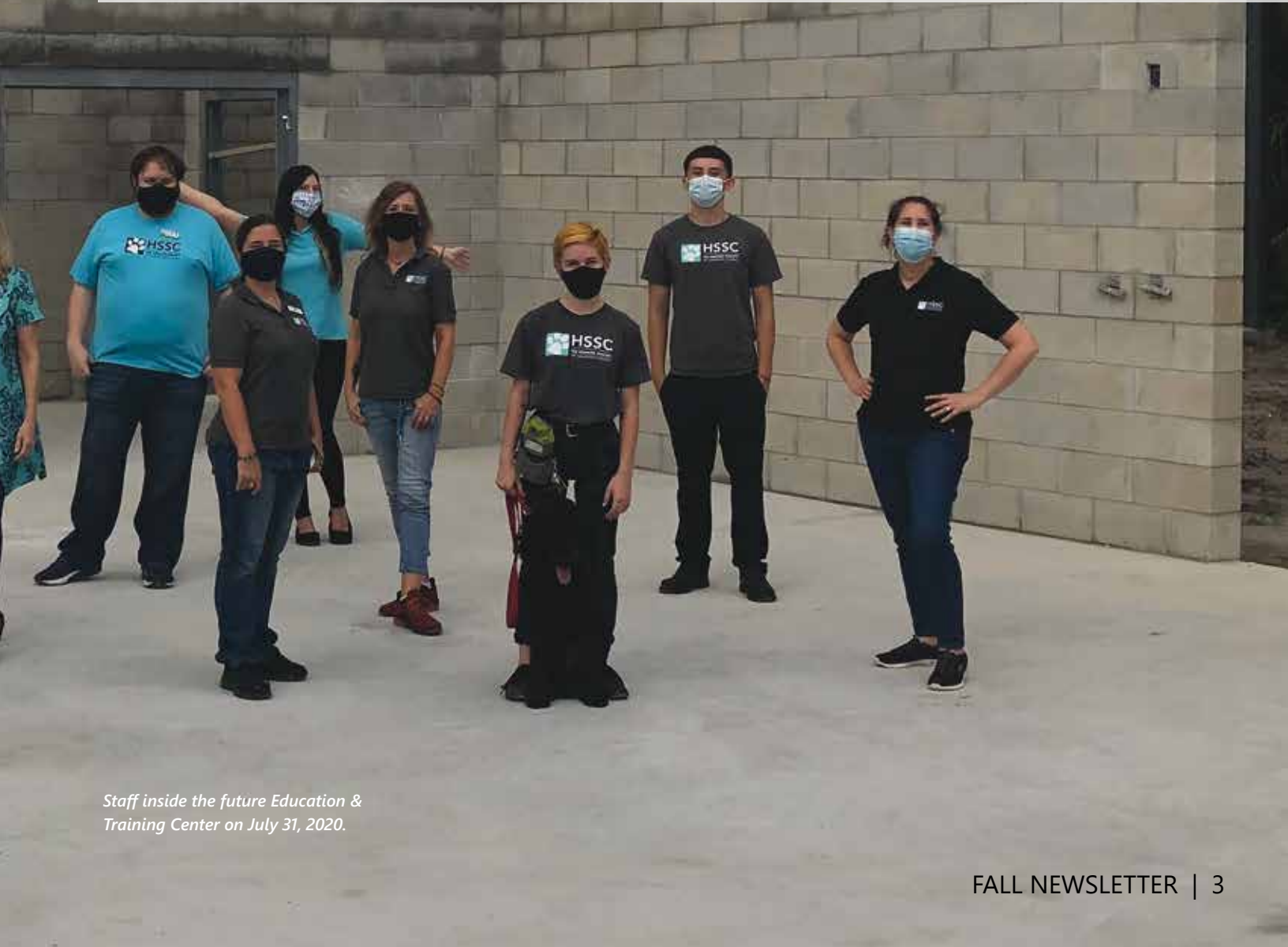
Staff inside the future Education & Training Center on July 31, 2020.

It has not been the year anyone expected, but we are making the most of it. As always, none of it would be possible without you. Thank you for being a constant when everything else has been in flux. We appreciate you more than ever, and we cannot wait until we can throw open the doors of our new space and welcome everyone inside.