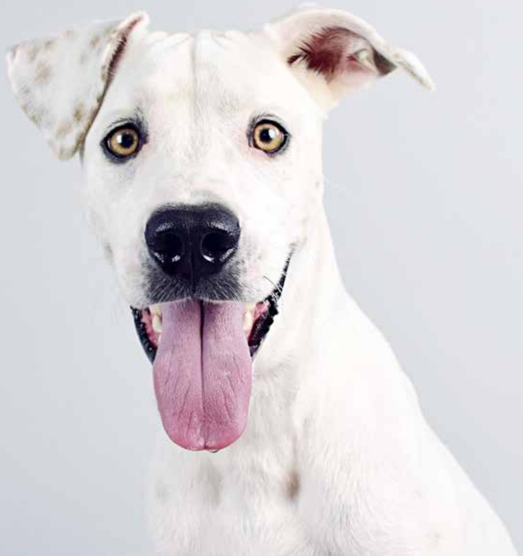
Fred, HSSC Alum