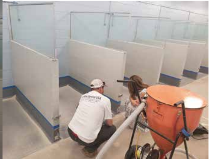
Pod 2 gets a facelift with new flooring, acoustical upgrades, improved drainage, and fresh paint.