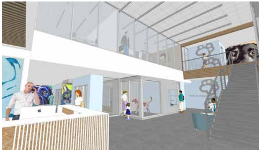
Clockwise from top: Exterior view; group cat room with state-of-the-art feline housing; and main lobby with a view of the featured pet area.